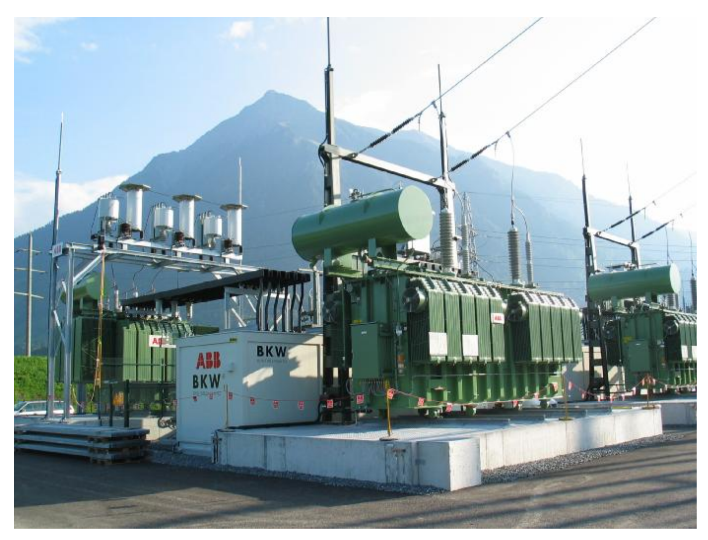
ABB 20-MW-Converter – 4 Units 3AC 50 kV 50 Hz – 2AC 132 kV 16,7 Hz 84 MVA / 80 MW