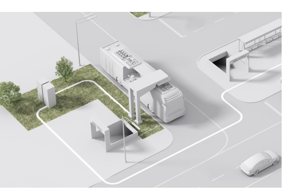
ABB offers highly efficient drivetrain solutions for electric buses consisting of HES880 drive modules and permanent magnet traction motors. Its design is based on proven technology. In addition, ABB offers a modular onboard battery system customized to the needs of vehicle manufacturers and transport operators.