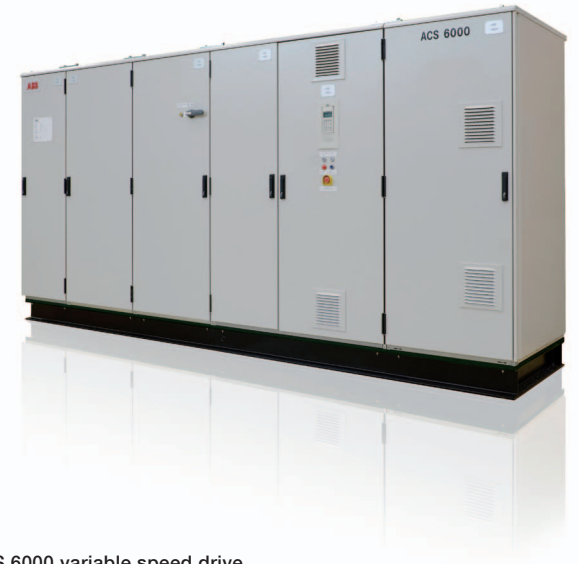
ABB offers a fast recovery option for its ACS 6000 medium voltage drive to further increase the drive's availability.