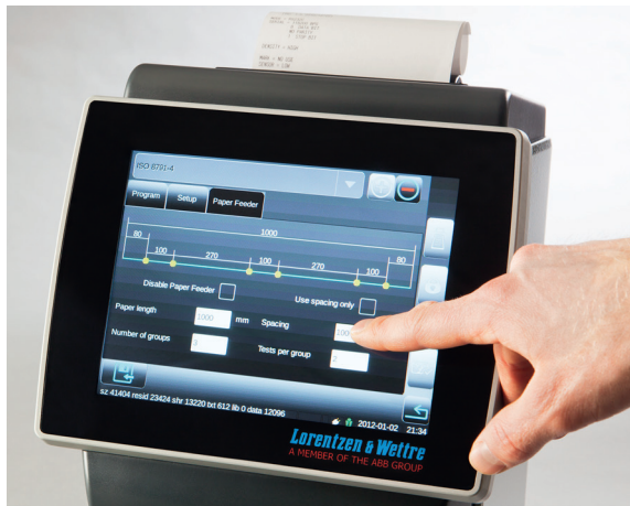
Touch screen for ease of use.