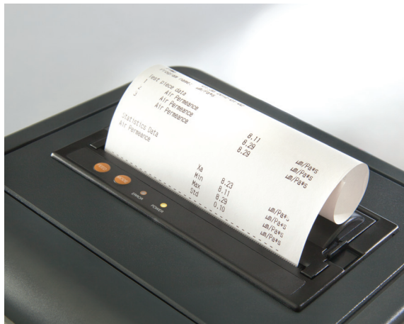
Built-in thermo printer.