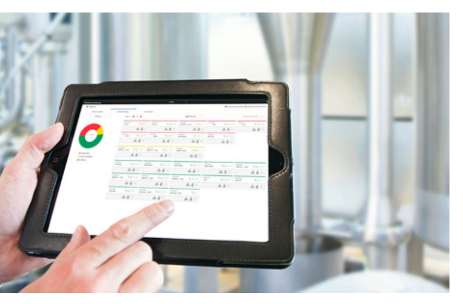
ABB Ability<sup>™</sup> Condition Monitoring for HV motors and generators continuously monitors key parameters in induction motors and synchronous motors and generators. It uses advanced algorithms to analyze the data and provides maintenance recommendations and early warnings. Unplanned downtime can be minimized, maintenance activities optimized and safety improved.

Users can access real-time information on the status of their motors and generators through a dedicated web portal