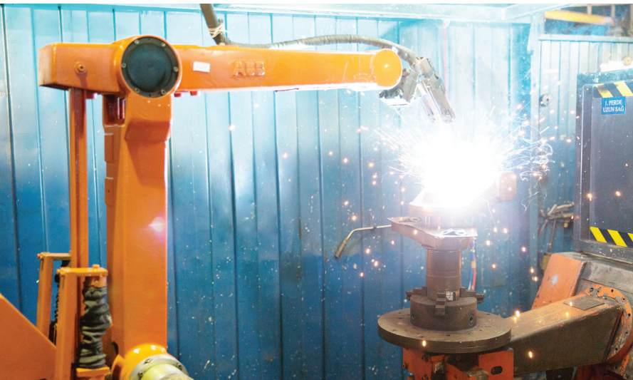
ABB robots are indispensable for Turkish axle manufacturer

Ege Endüstri has been designing and building axle housing units and axle components for the automotive industry for over 40 years. The company has two plants near the Aegean Sea in Izmir, Turkey and employs 565 staff.