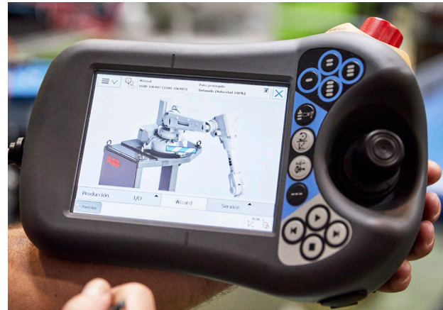
ABB's graphical wizard (01) enables regular engineering staff to easily implement changes to fulfill new customer requirements or implement new products (02).