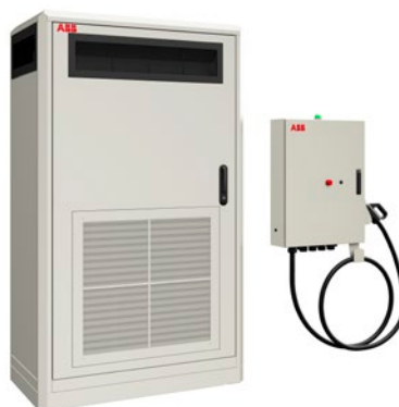
ABB High Power 150C charger for e-buses