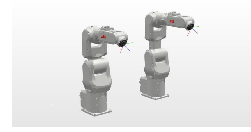
IRB 14050 (Single Arm Yumi)