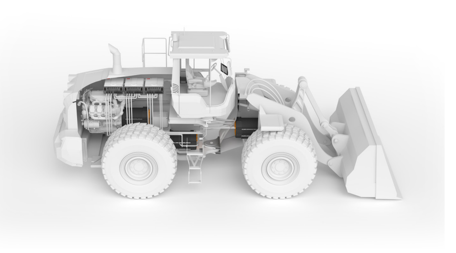
ABB offers complete electric drivelines for heavy working machinery – for example in mining, construction and material handling – optimized for each machine's actual working cycle. Our drivelines are designed for reliability and energy efficiency, reducing total cost of ownership while supporting productivity. An important step towards a sustainable future.

O1 E-mobility driveline solutions for heavy working machinery.