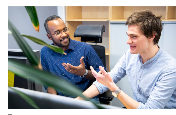
01 Collaborating closely with OEMs is key to designing drivelines that are optimized based on end-customer demands.

Backed by the global ABB organization and well proven building blocks, these drivelines can be rapidly mass produced, commercialized and integrated into new and existing machine designs – offering customers a fast lane to tomorrow's climate-smart heavy e-machines.