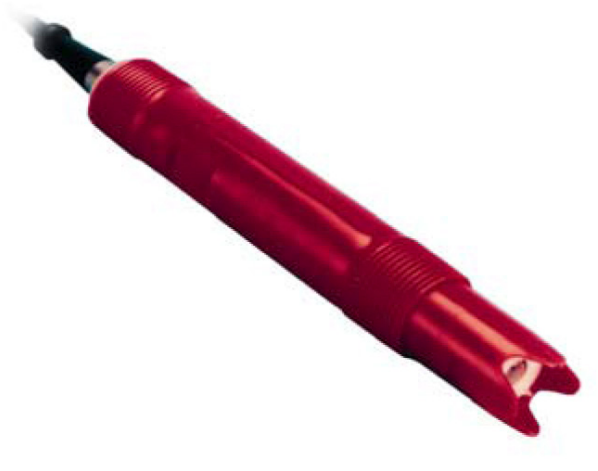
Figure 2 ABB TB556 pH Sensor