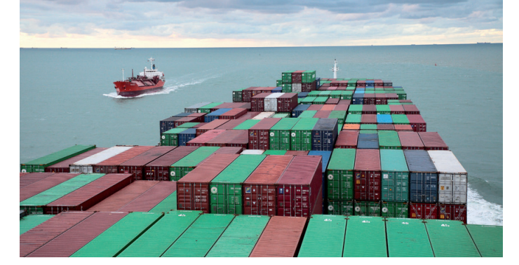
ABB Marine services centers